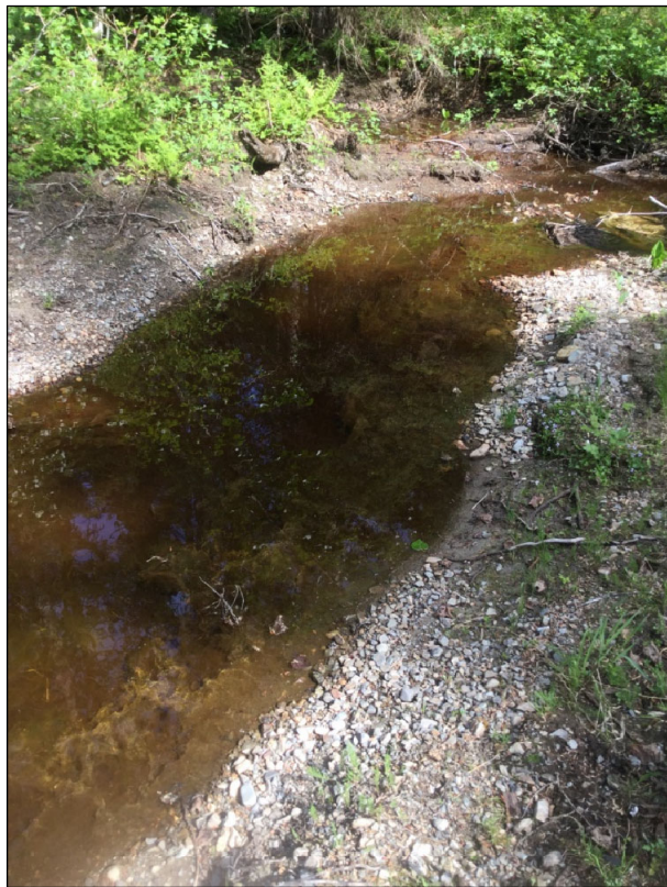
Figure 2.—Channel at waypoint 442.