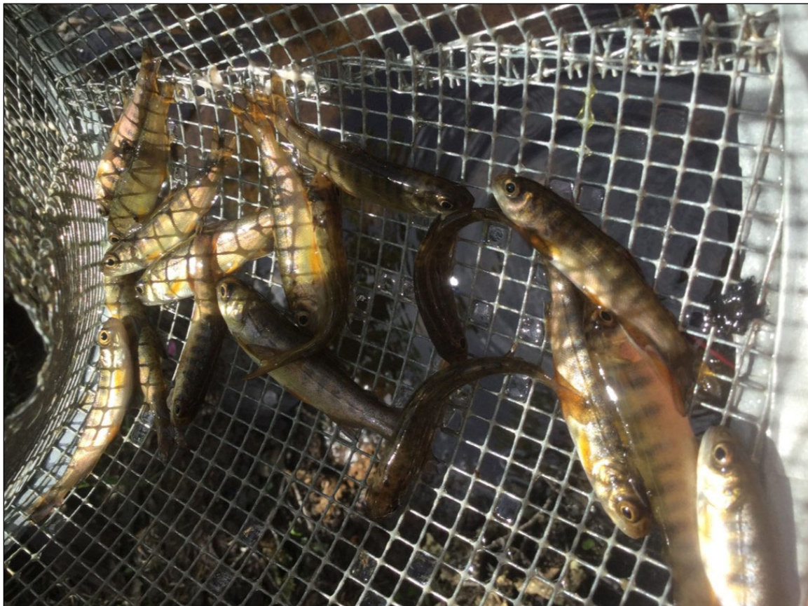
Figure 1.—Juvenile coho salmon captured at waypoint 442.