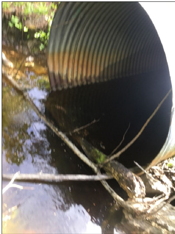
Figure 3.—Culvert outlet at waypoint 442.